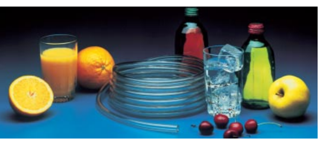
The most widely specified clear, flexible tubing, Tygon® Beverage Tubing is frequently chosen for its taste- and odor-free characteristics